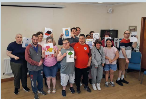
Sessions on health and wellbeing, including staying safe in the sun