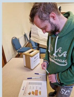
Getting ready for the general election in May 2024 by learning about voting and voter ID