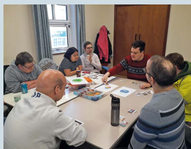
Household Support Grant session on cost of living

“It gave me ideas about how to stay warm and save money by buying cheaper supermarket own brands”