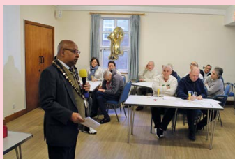
Basingstoke Mayor opening the celebration event hosted by Friday Network on 22 nd November 2024